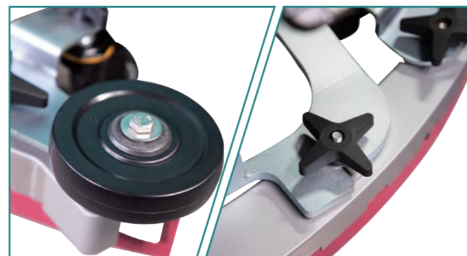
Squeegee assembly/brush cover are both collocated with anti-collision design