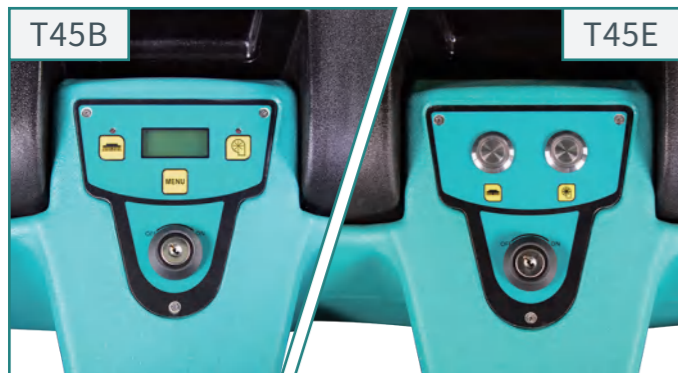
Simple Design Control Panel