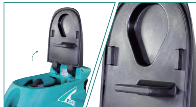
Solution tank can be opened, collocated with high quality sealed-ring